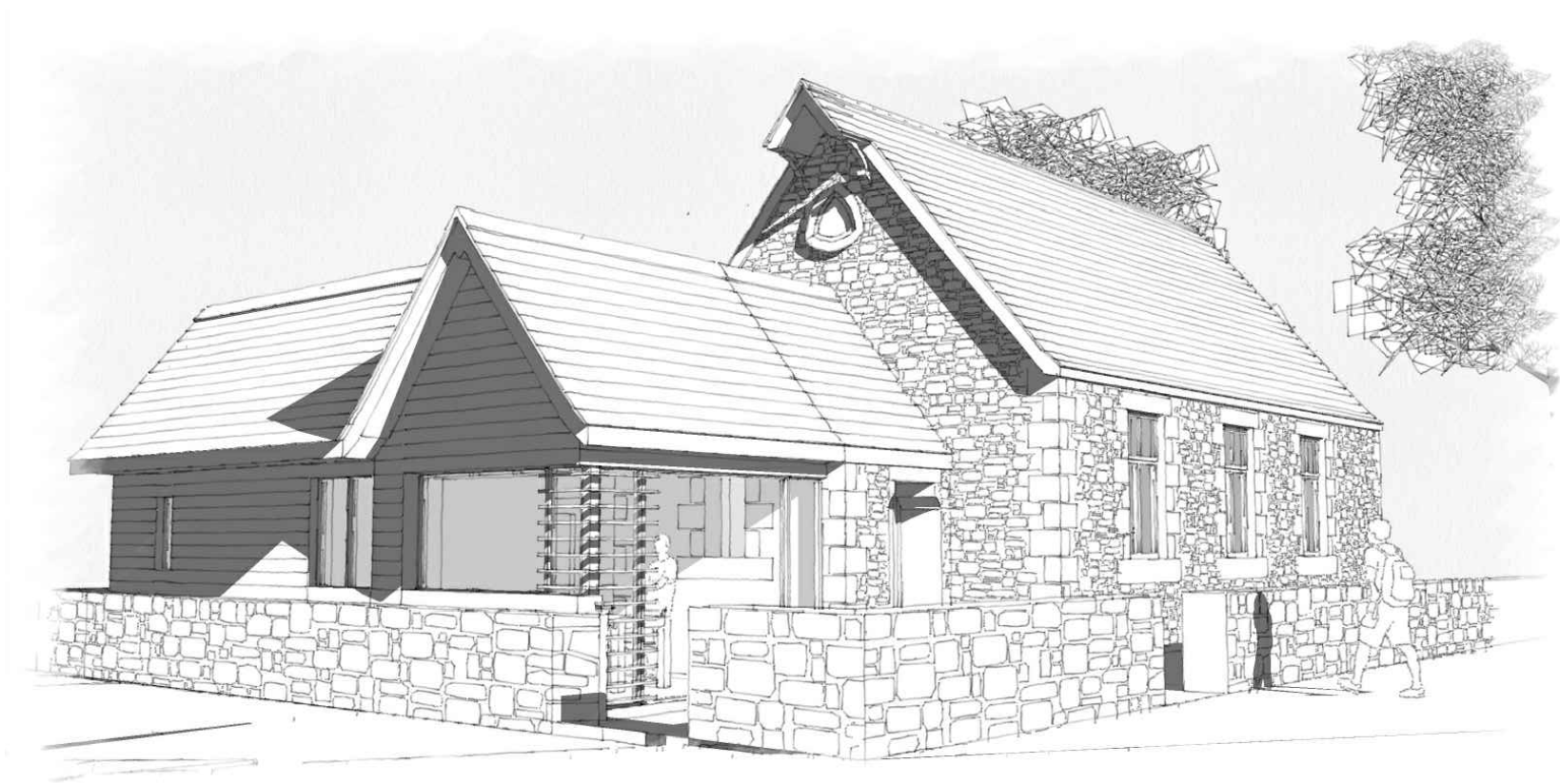
ILLUSTRATIVE SKETCH PERSPECTIVE